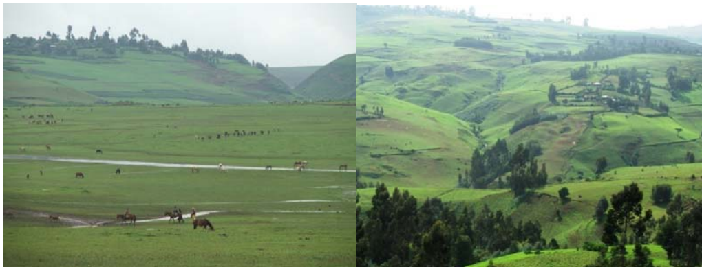
Plate 3: Meja River catchment: a) the upper catchment – a broad valley b) mid-catchment - deeply incised valley.

The Jeldu area, located in the south of the Abbay basin to the north-east of Ambo is predominantly a highland area. The major river draining approximately south-north is the Meja River, a tributary to Guder River. The River originates at high altitude just outside Jeldu in the Dandi Woreda. The headwaters are in a flat wide valley, which is a wetland heavily utilized for livestock grazing (Plate 3a). It then drops steeply and flows through a relatively narrow deeply incised valley. Numerous tributaries drain into the Meja from both the east and west. These are also deeply incised – mountain streams - with relatively small catchments (i.e. typically 3-4 km 2 ) (Plate 3b).